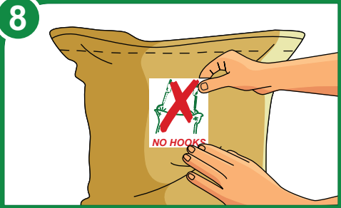
Stick the 'No Hooks' label on the outer bag.