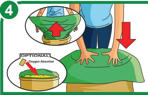
Unroll and remove air by pressing down on the commodity.

OPTIONAL: Add oxygen absorber to immediately lower the oxygen level.