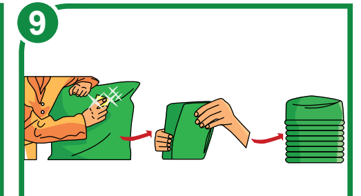
After using, clean, dry and fold undamaged GrainPro Hermetic Bag Farm and save it for future use.