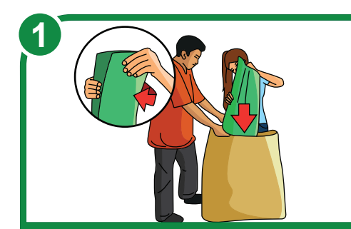
Fold GrainPro Hermetic Bag Farm lengthwise and place inside the outer bag. Outer bag should be smaller than the GrainPro Bag.