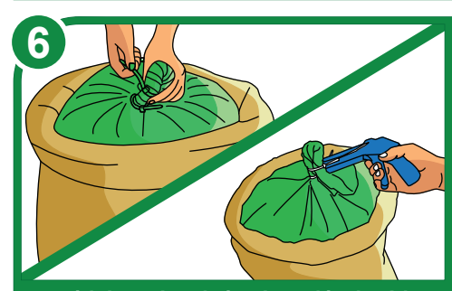
Fold the twisted plastic and lock with another cable tie or rope.