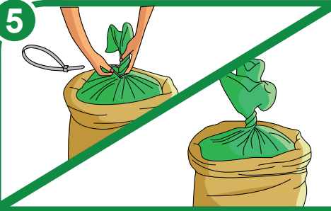
Twist the extra plastic tightly. Tightly fasten reusable cable tie or rope

In case of pulses, oxygen absorbers are to be added (1 sachet per 50 kg commodity)