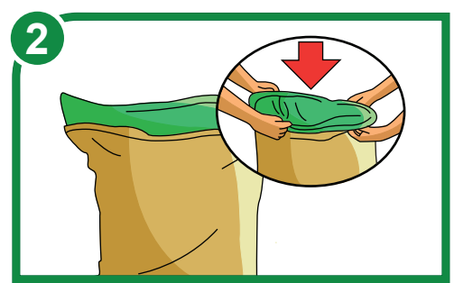
Unfold GrainPro Hermetic Bag Farm and roll extra plastic to prevent damage.